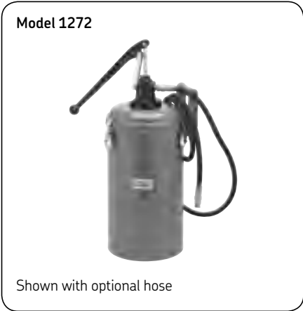
Shown with optional hose